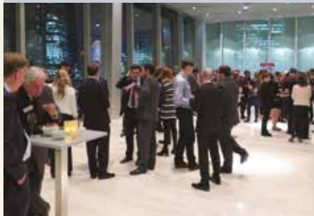
The Moritz-Heyman Project drinks reception, Rothschild Bank, London.